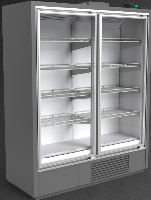
Wetar SNWE-02 1564 DTO