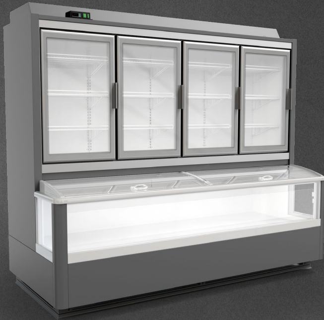
Mix MNMY-H2 2500 CCP