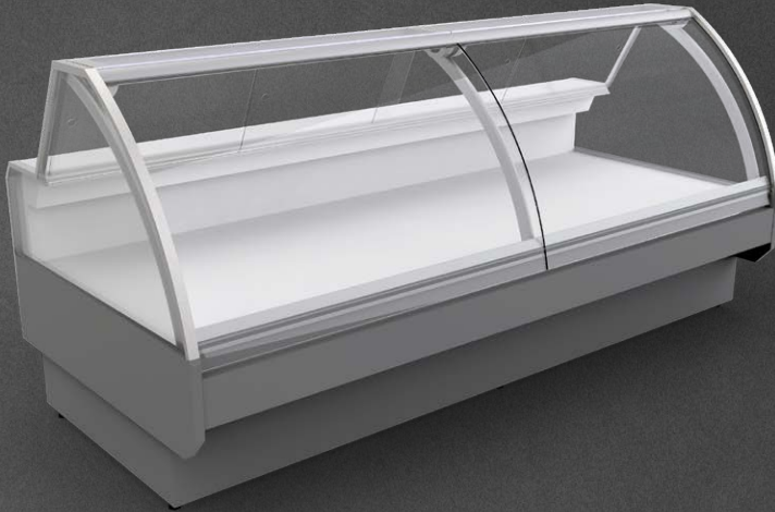
Lhotse LDLH-47 2500 GCL