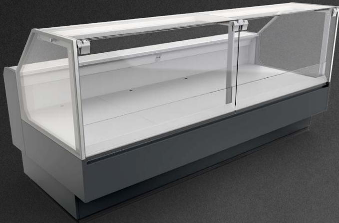
Lhotse LDLH-37 2500 GSL