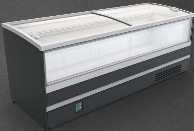
Imja WNIJ 2500 CCS