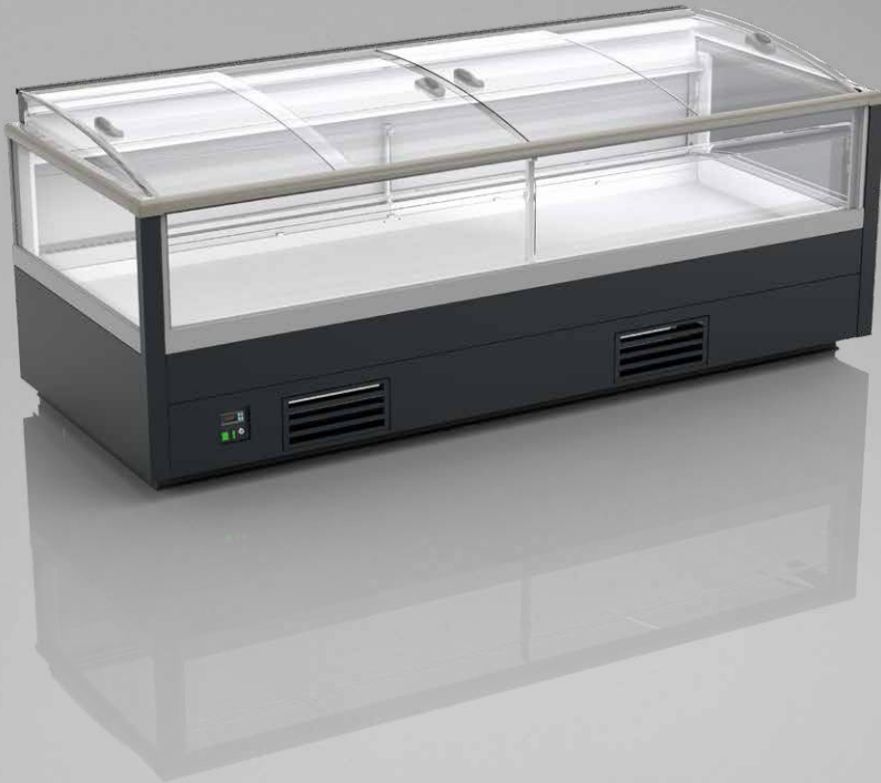
Imja WNIJ-06 2500 CCS

CCS — cover | single, curved | sliding (sideways)