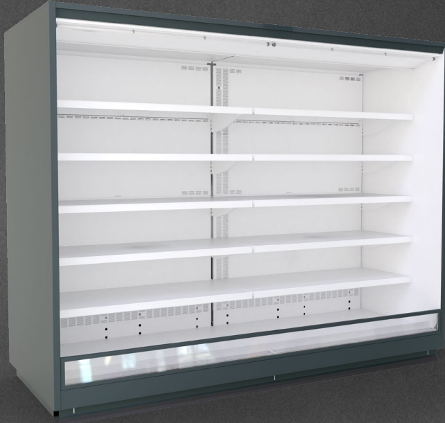
Iberg 2.0 RDIG-H2 2500 BDA