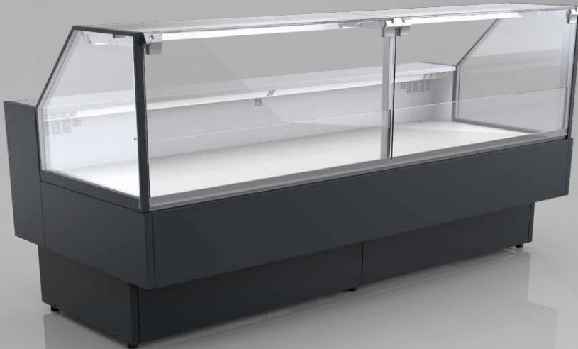
Grazia LDGR-29 2500 GSL

GSL – glass | single, straight | lift up