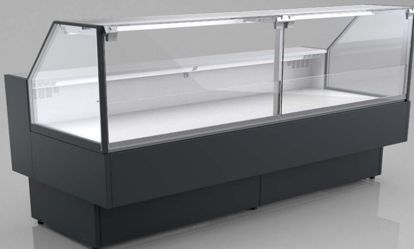
Grazia LDGR-29 2500 GSL

GSL – glass | single, straight | lift up