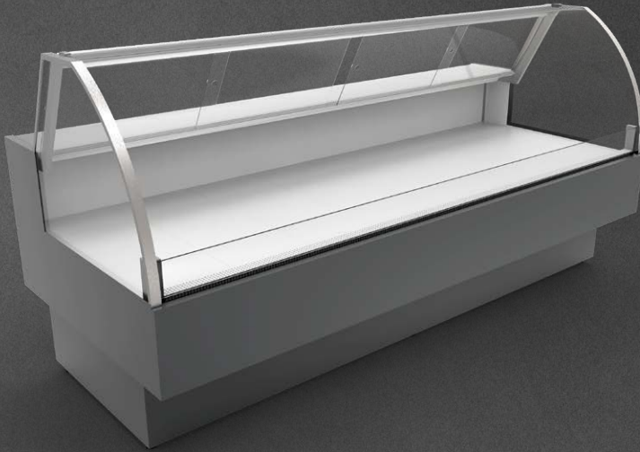
Grazia LDGR-09 2500 GCL