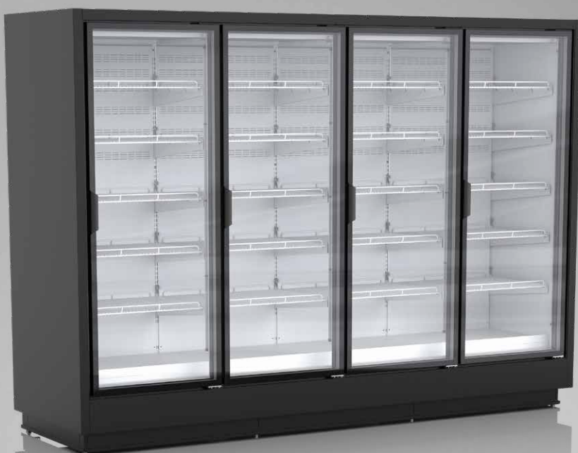
Glacier SNGL-H3 3123 DTO