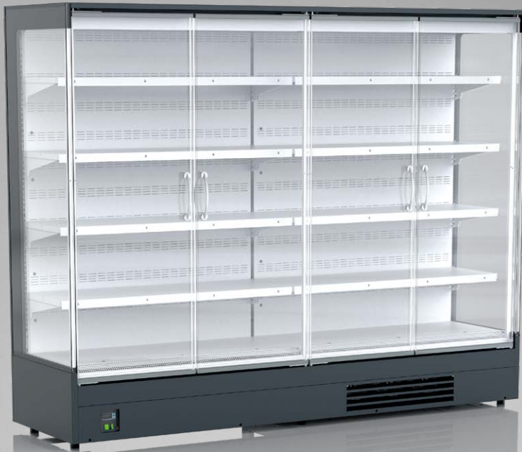
Garmo RDGA-L5 2500 DVO

DVO – door | double, straight (High Vision) | hinged DDS – door | double, straight | sliding (sideways)