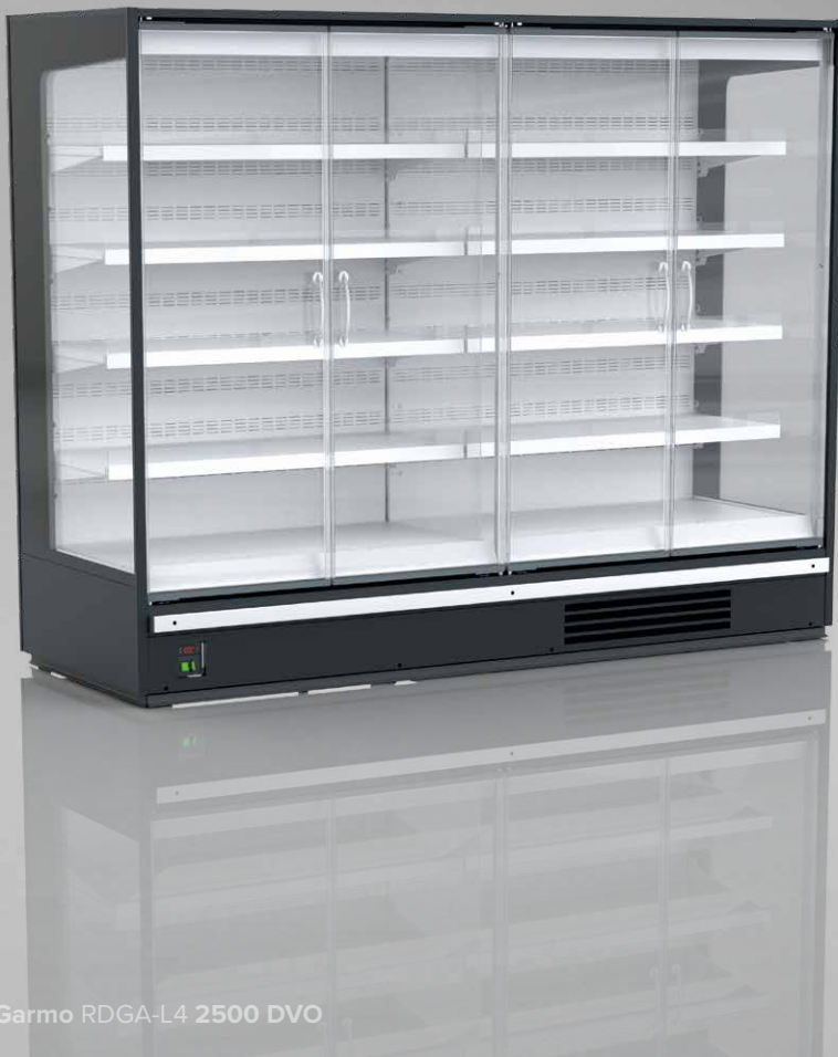
Garmo RDGA-L4 2500 DVO