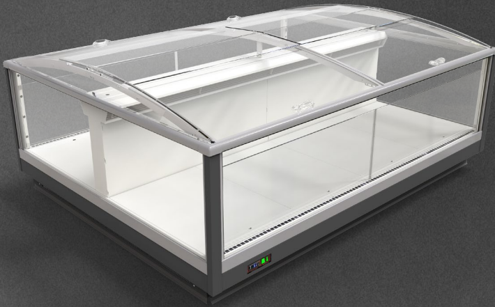
Everest WNEV-17 2500 CCP