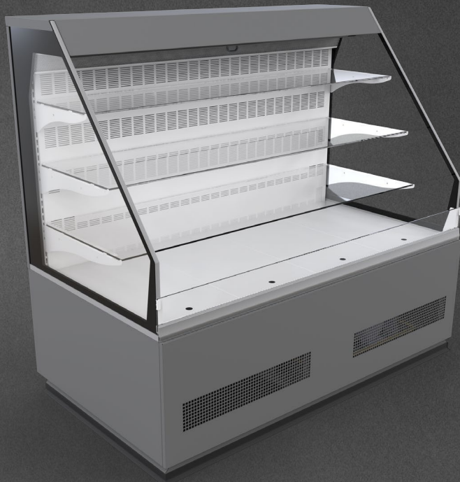
Elegant RDEL-22 1400 BSA