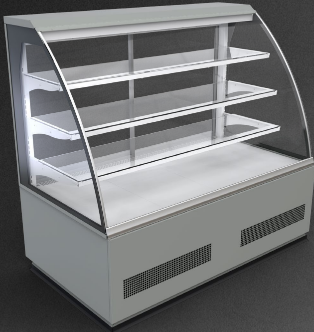
Elegant RDEL-05 1400 GBT