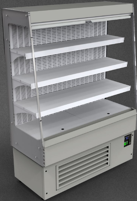
Atlanta RDAT-30 0980 XXX