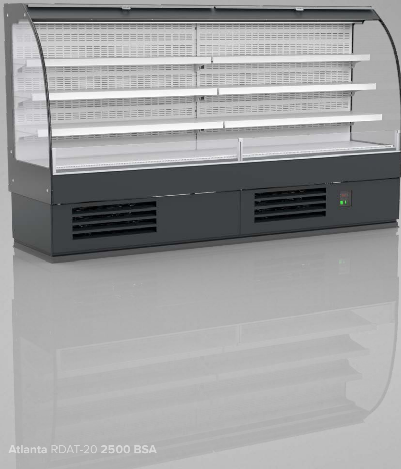
Atlanta RDAT-20 2500 BSA

BSA — low glass or front glass riser | single, straight | fixed