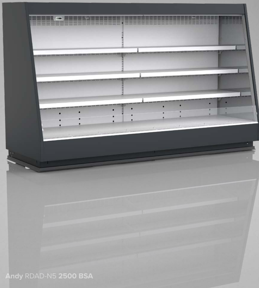
Andy RDAD-N5 2500 BSA

DBS – door | double, bent | sliding (sideways) DDS – door | double, straight | sliding (sideways)